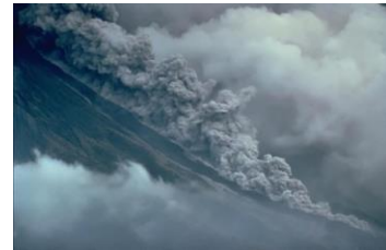
Small pyroclastic flow at Mayon volcano in the Philippines