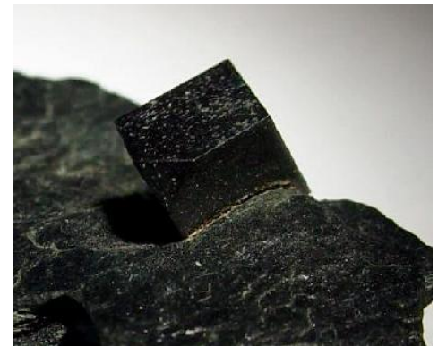
An example of a magnetite pointing in the direction of the magnetic