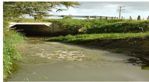
Fertilizers and animal wastes runoff into streams

Freshwater and ocean pollution affect the availability of safe water for humans and the environment. Water pollution kills millions of people in underdeveloped countries each year.