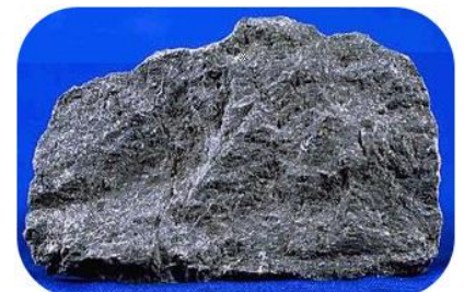
Extrusive igneous rocks have tiny crystals.