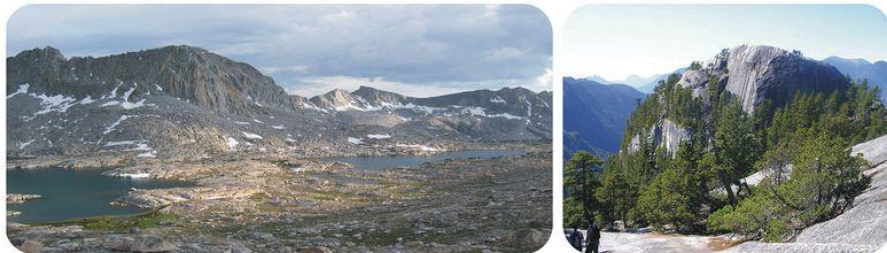
California's Sierra Nevada is intrusive igneous rock exposed at Earth's surface.